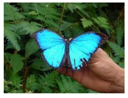
Learn all about butterflies and other jungle creatures at Pilpintuwasi

On arrival, a volunteer guide will welcome you to the wellnestled property and lead you to the eggs and larvae room. Here you will learn about the compete life cycle of a butterfly and their impressive development process. The full grown