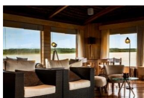
Indoor lecture room & lounge