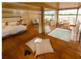
Deluxe Master Suite