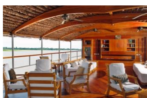
Outdoor lounge & bar