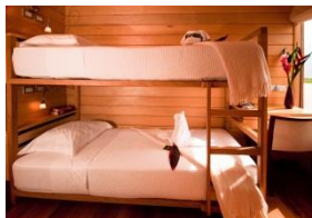
Bunk bed cabin